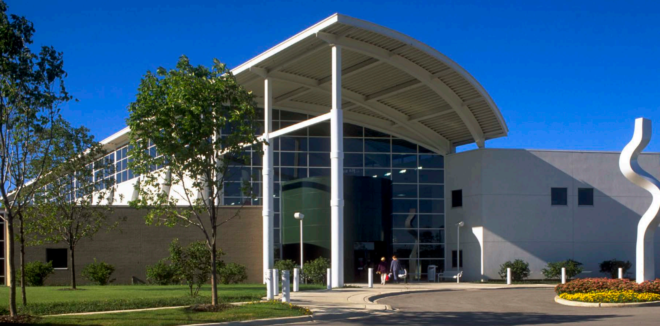
Northwest Community Hospital, Arlington Heights, Illinois