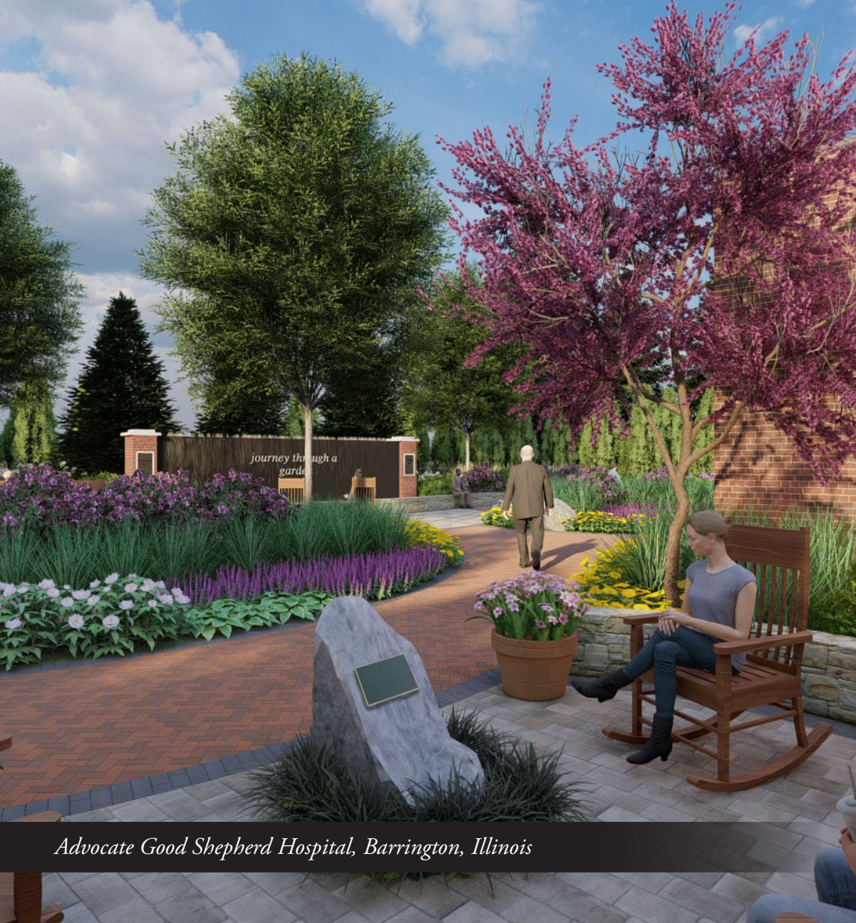
Advocate Good Shepherd Hospital, Barrington, Illinois