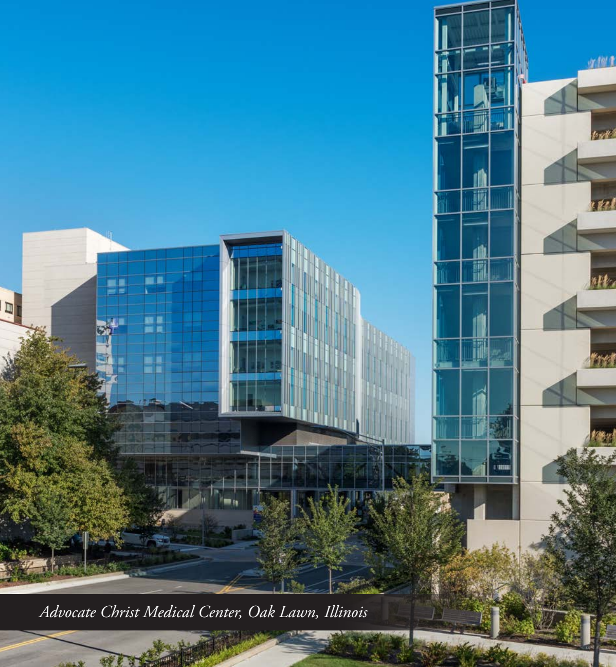
Advocate Christ Medical Center, Oak Lawn, Illinois