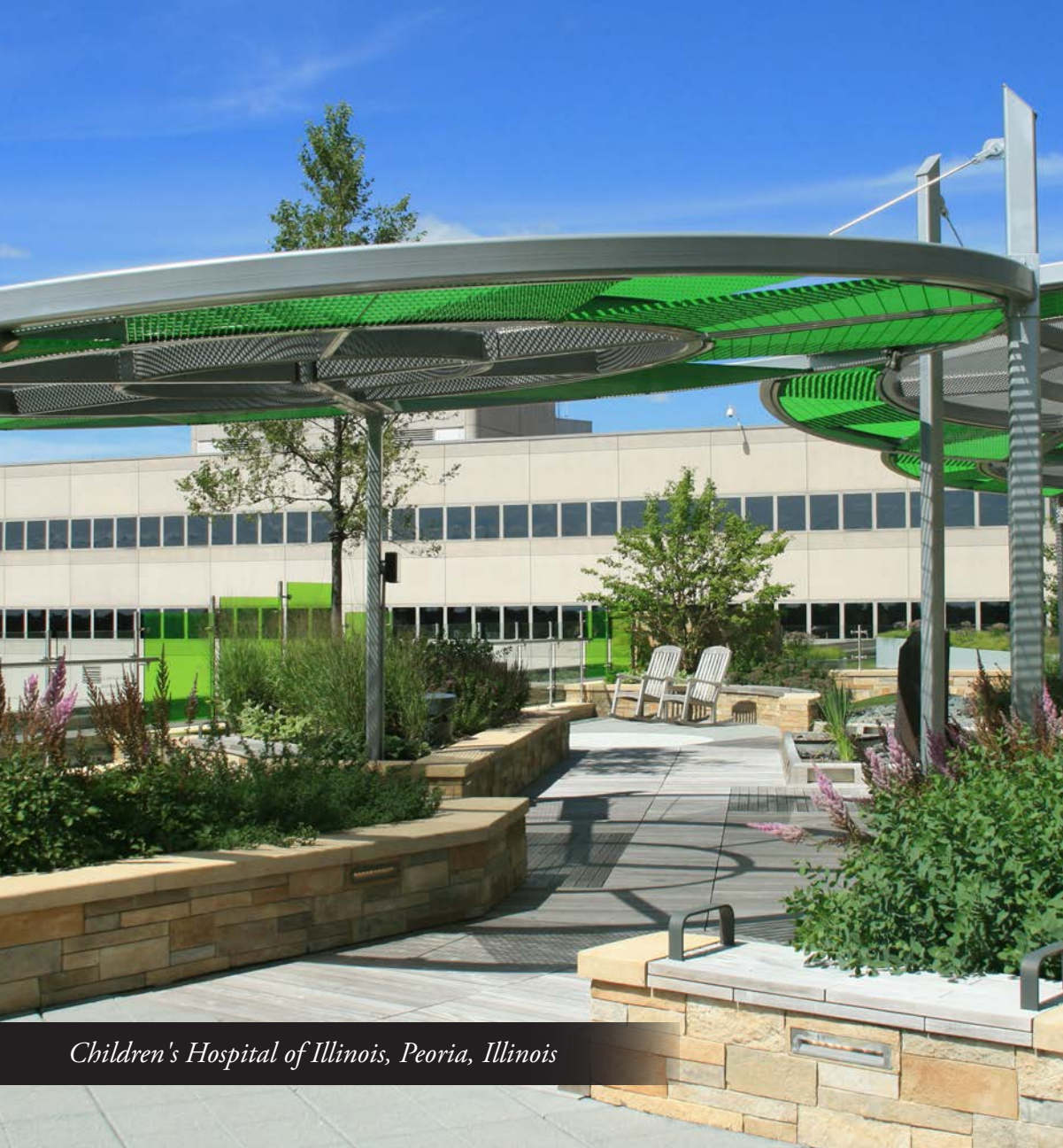
Children's Hospital of Illinois, Peoria, Illinois