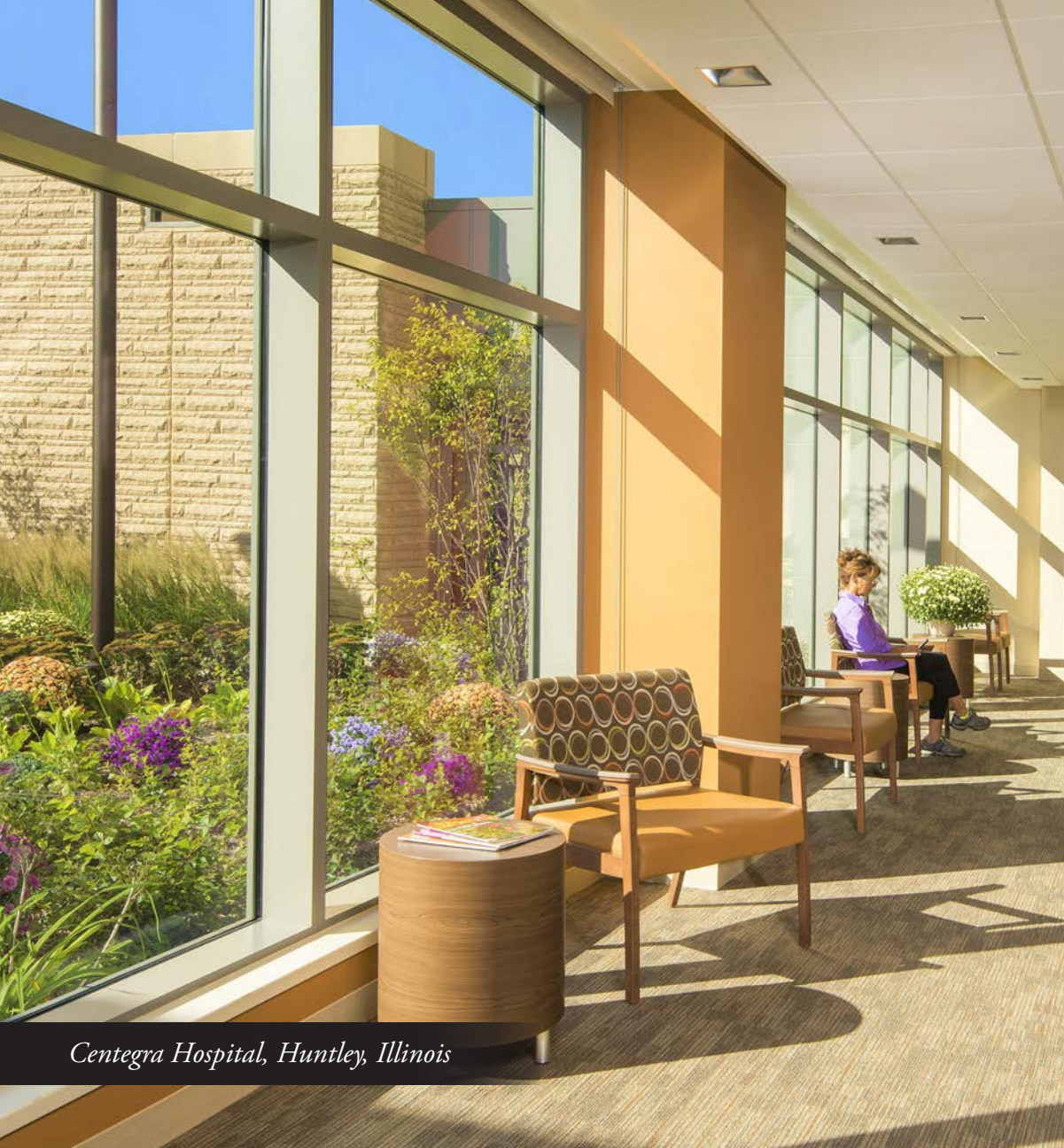
Centegra Hospital, Huntley, Illinois