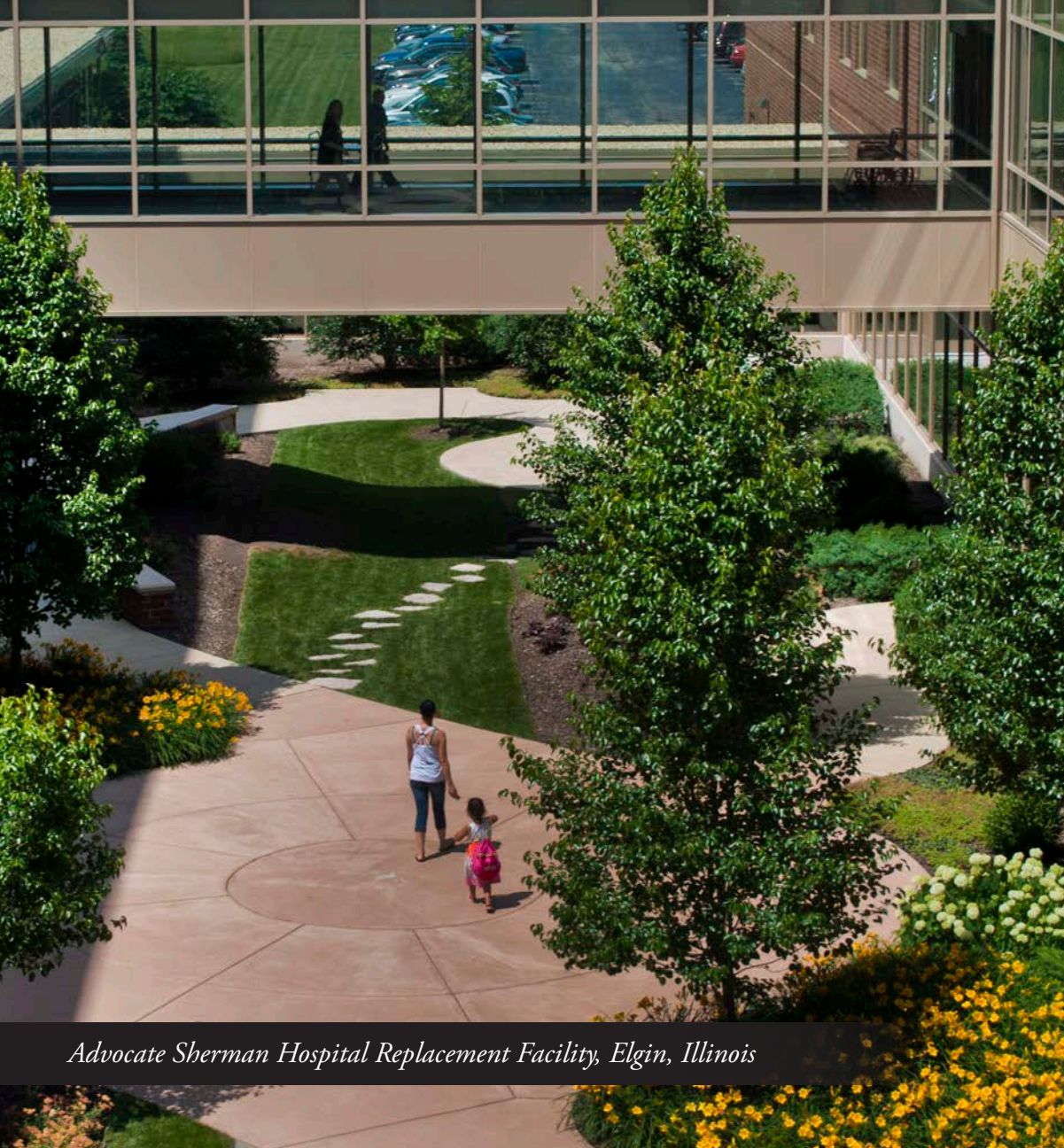
Advocate Sherman Hospital Replacement Facility, Elgin, Illinois