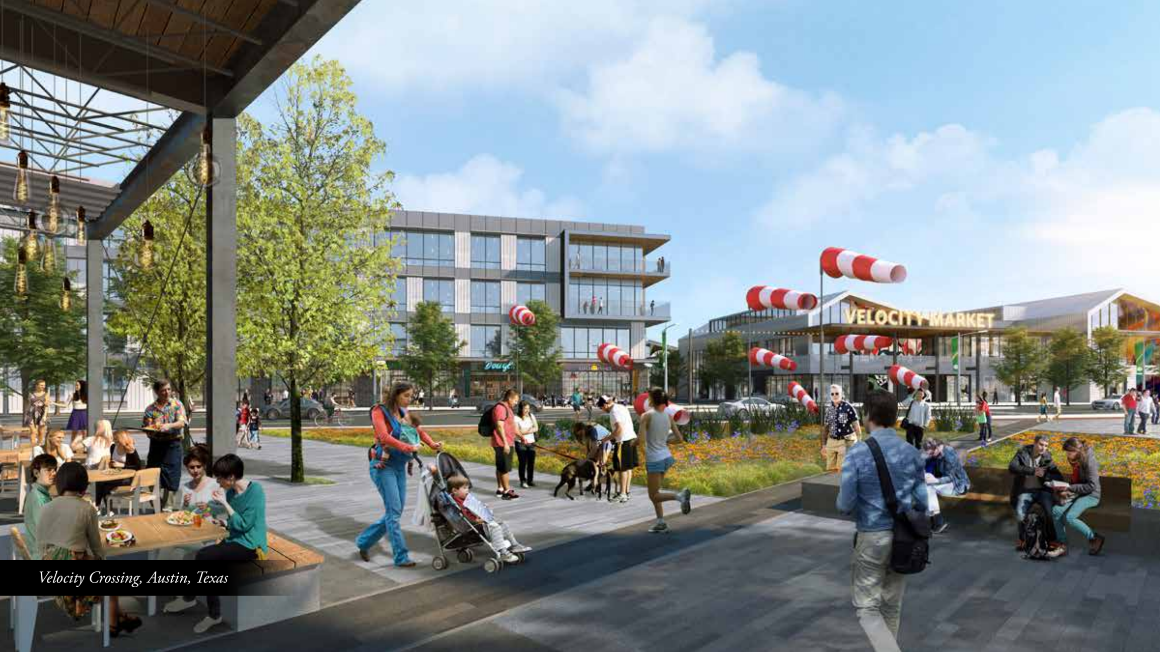
Velocity Crossing, Austin, Texas