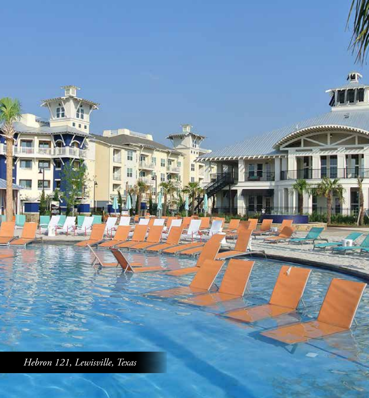
Hebron 121, Lewisville, Texas