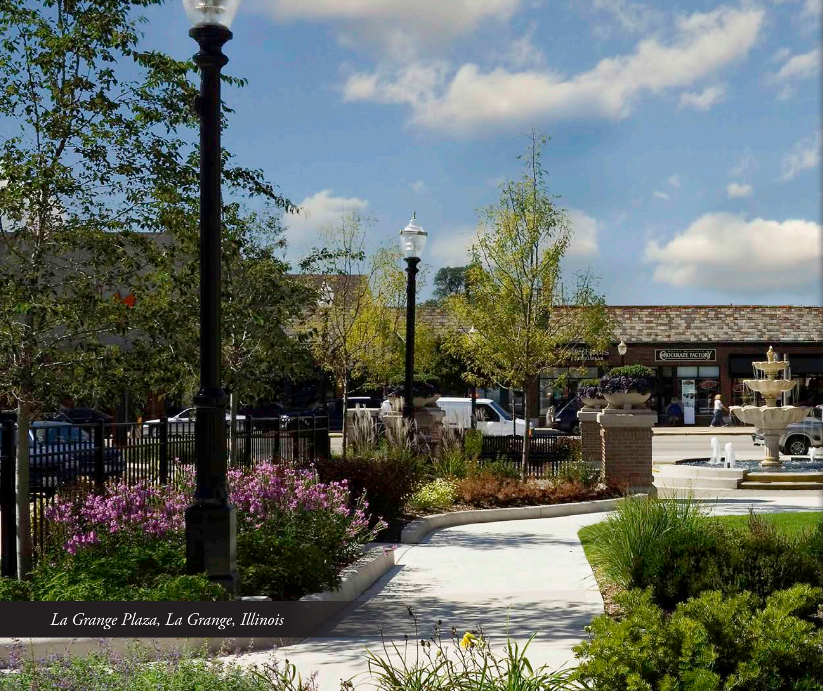
La Grange Plaza, La Grange, Illinois