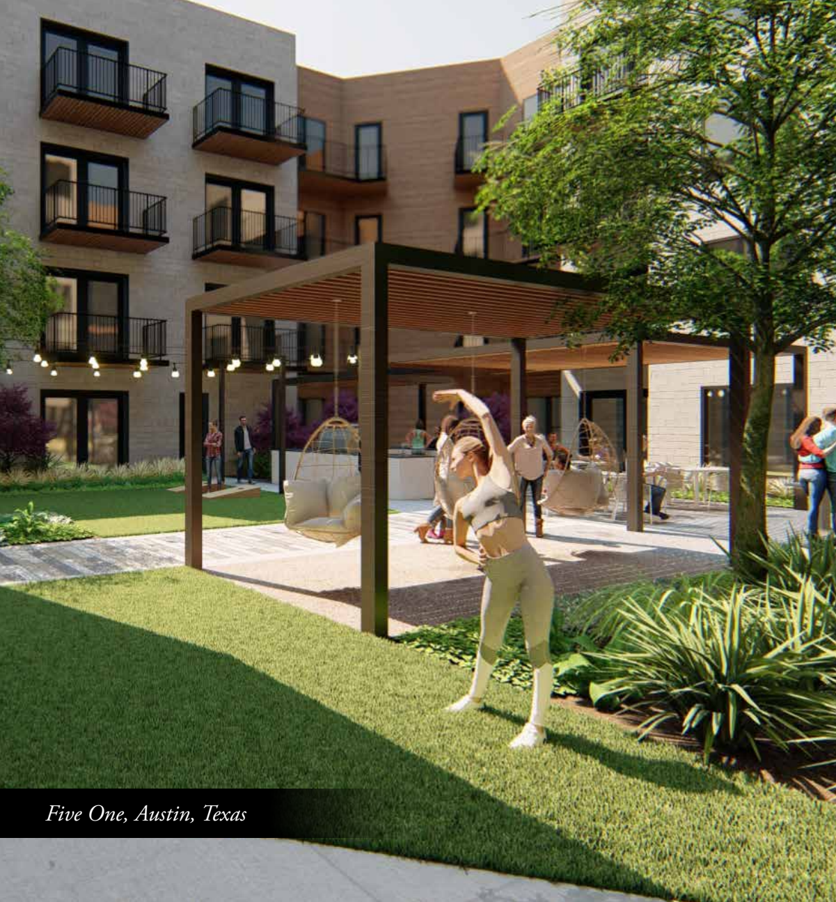
Five One, Austin, Texas