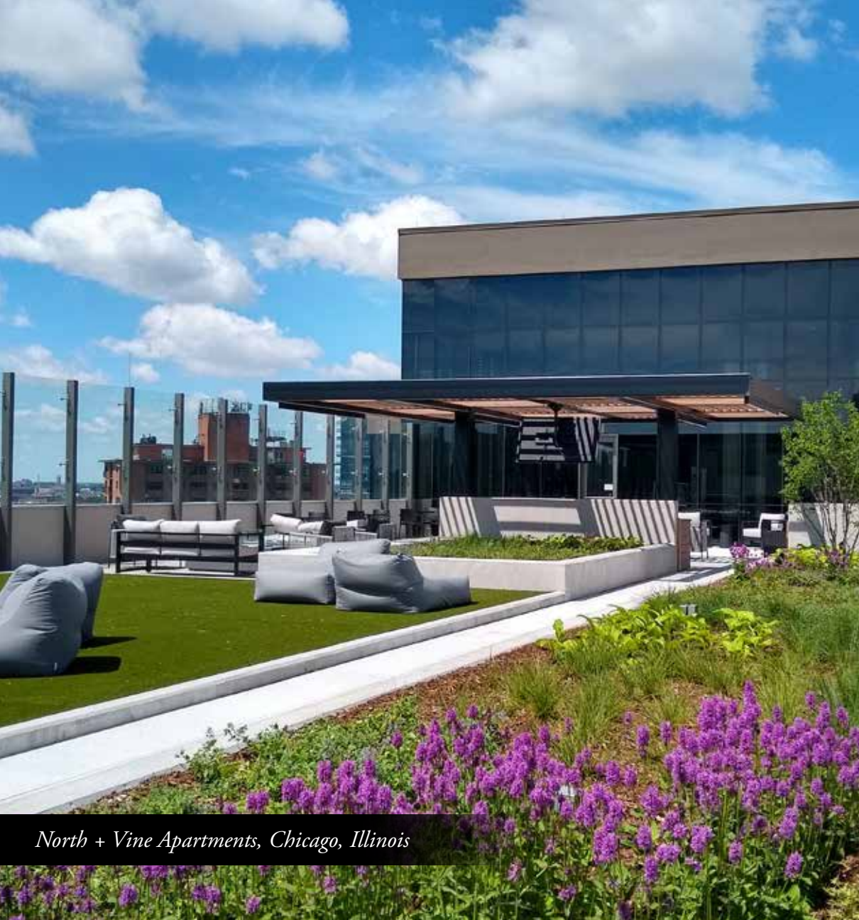
North + Vine Apartments, Chicago, Illinois