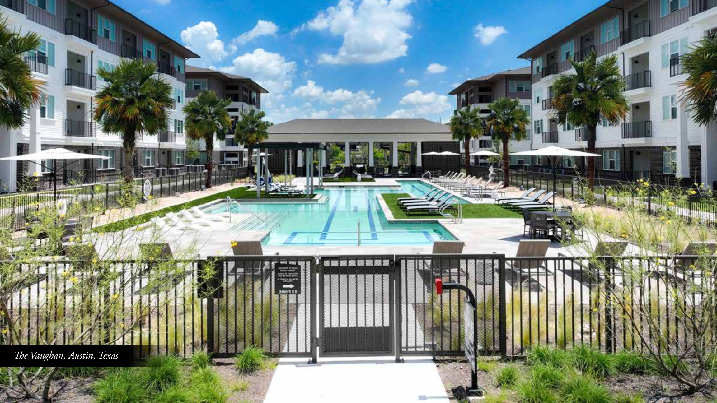
The Vaughan, Austin, Texas