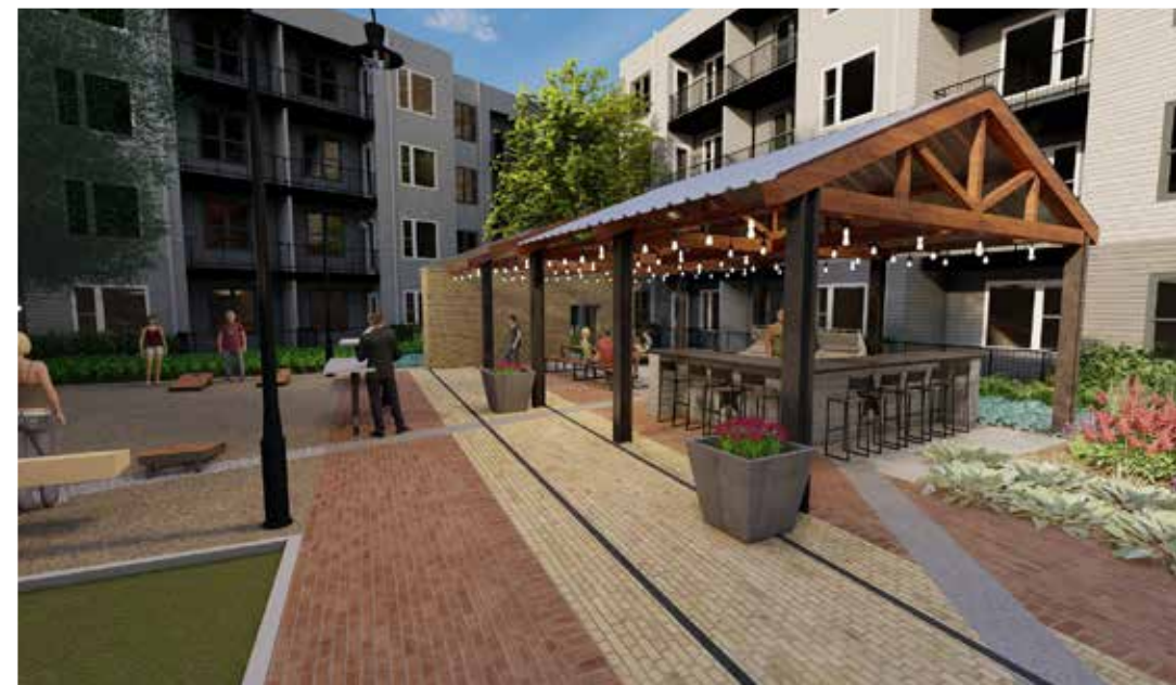
Lakeline Station, Austin, Texas