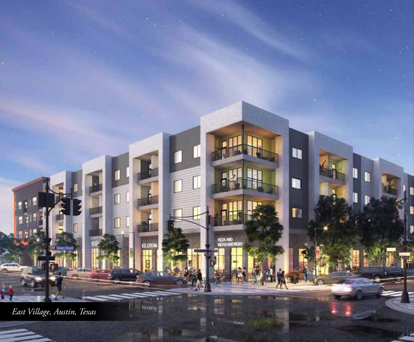
East Village, Austin, Texas